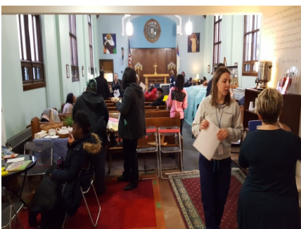
Clinic on 2/15. Lots of activity in the reception area, teaching area, and social services area in the newly remodeled sanctuary of Family of God Lutheran Church